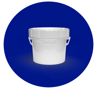
2.5 Gallon NG