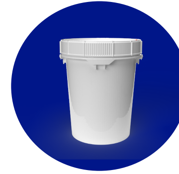
6.5 Gallon NG