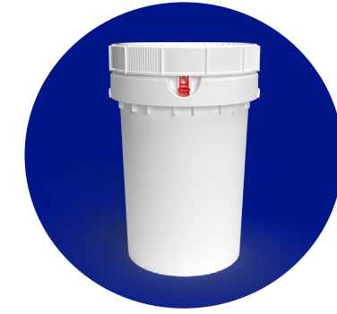
12.0 Gallon NG