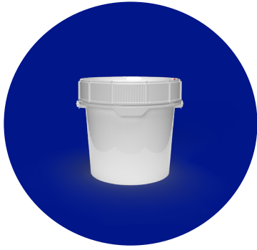
3.5 Gallon NG