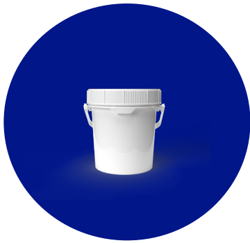
0.6 Gallon NG