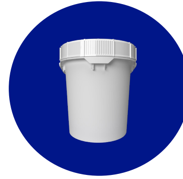
5.0 Gallon NG