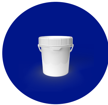
1.25 Gallon NG