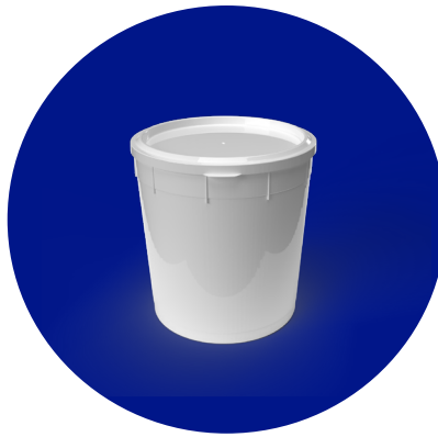
10 Quart SL