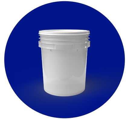
15 Liter SL

Snap Lite is the number one pail choice for many industries and applications