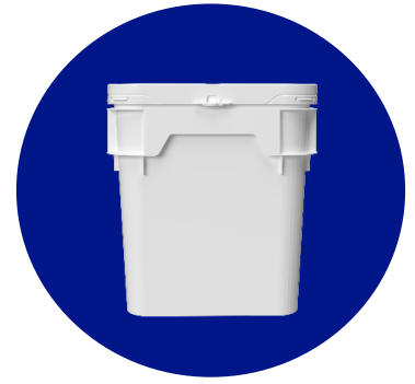
4.0 Gallon K1