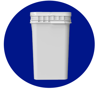
6.5 Gallon K1

Super Kube 1 is the number one pail choice for many industries