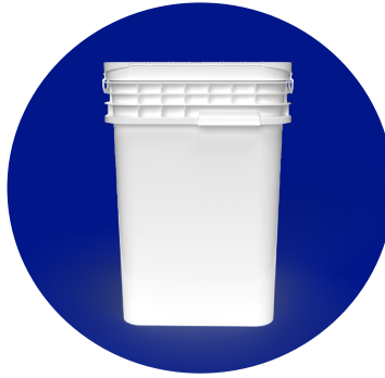
5.0 Gallon K1