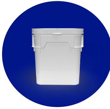
3.5 Gallon K1